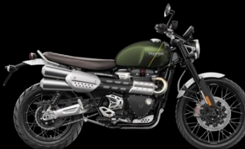
Scrambler 1200 XC

A truly unique experience taking this iconic bike back to its roots. An urban modern classic that delivers plenty of rugged off-road attitude and cool versatility.