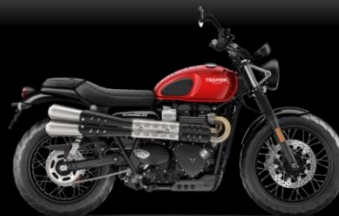
Bonneville Street Scrambler

A truly unique experience taking this iconic bike back to its roots. An urban modern classic that delivers plenty of rugged off-road attitude and cool versatility.