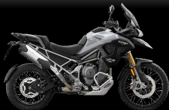
Tiger 1200 Rally Pro