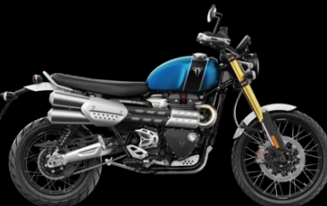
Scrambler 1200 XE

Developed to be the ultimate motorcycling experience in terms of style, road-going capability, comfort and true off-road adventure; designed to be brilliant whatever the terrain.