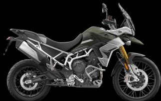
Tiger 900 Rally Pro

An exciting new Tiger range designed for maximum off-road adventure and all-day riding capability, control and comfort, courtesy of the greatest ever triple engine, performance and specification.